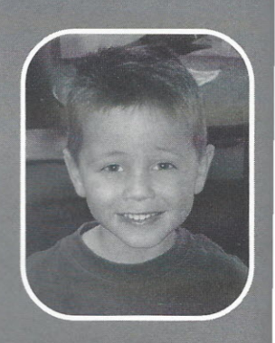
"I learned how to say my ABC's."