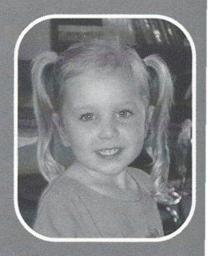
"I learned how to count to 20."