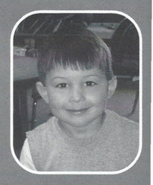
"I learned how to write my name."