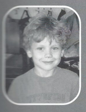
Nana's house because we do all kinds of stuff."