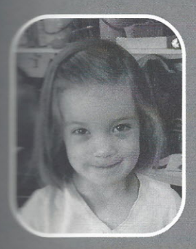
Tlike to go swimming during the summer."

What do you like to do during the summer?