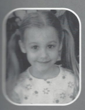
"I like to play outside with my dogs during the