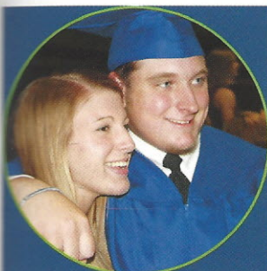
4. The graduates, along with the Heads of School and the Chairperson of the Board of Directors, watches as the other graduates to march in.