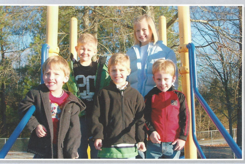
* Most insurance programs and Medicaid welcome.