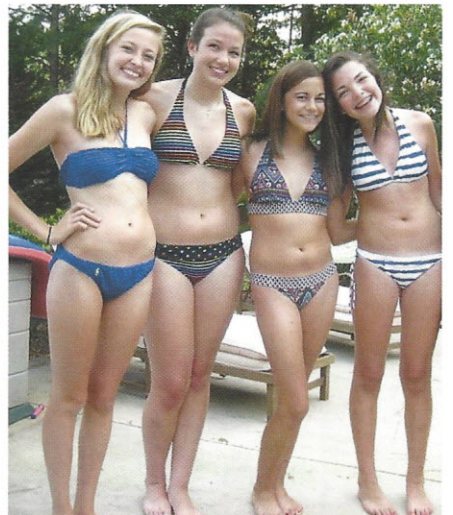
These RWA girlfriends pause to get a quick picture before jumping back into the pool.