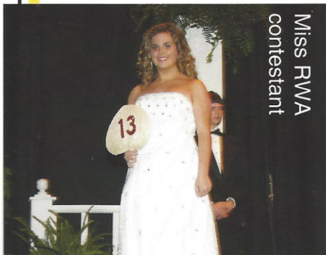
Miss RWA contestant