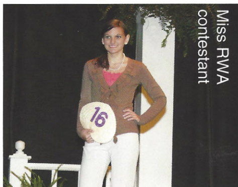
Miss RWA contestant