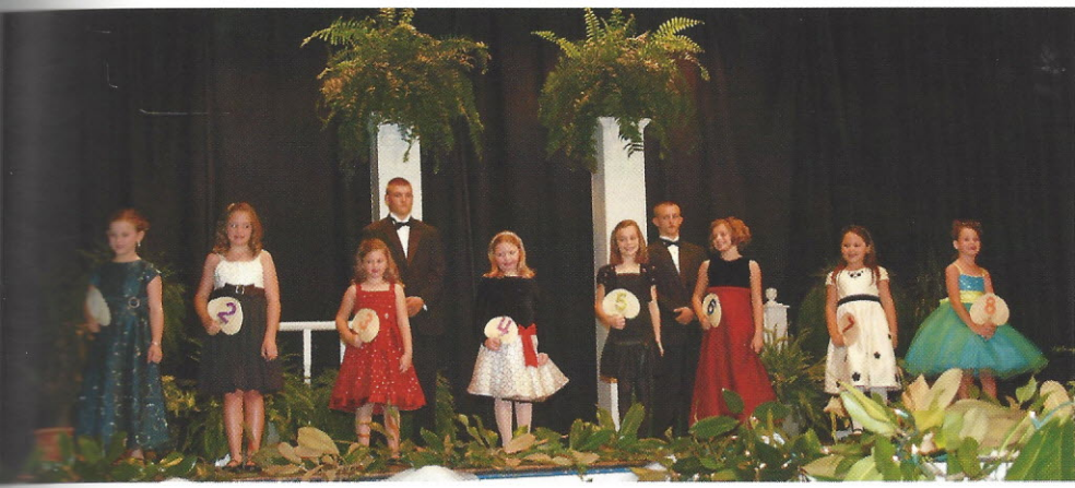
Wee Miss contestants line the stage as a group to allow the judges and audience a final look in their "dressed up" attire.