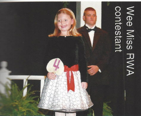
Wee Miss RWA contestant