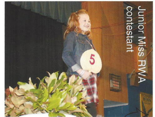
Junior Miss RWA contestant