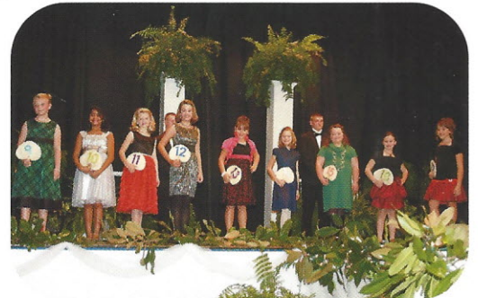
The Little Miss contestants pose in their formal wear for the judges.