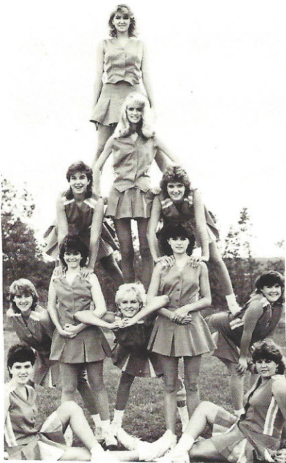
Varsity Cheerleading squad 1985