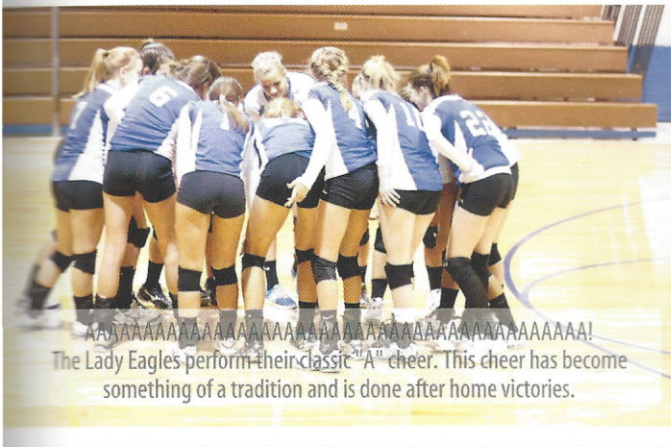
AAAAA AAAAAAAAAAAAAAAAAAAAAAAAAAAAAAAAAAAAAAAAAAAAAAAAAAAAAAAA! The Lady Eagles perform their classic "A" cheer. This cheer has become something of a tradition and is done after home victories.