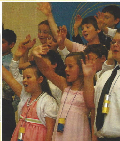
So Long! During the music program, the fourth grade students wave to the audience. The students provided entertainment by playing the recorder, a new skill developed this school year.

At Richard Winn Academy, the school colors get in your blood. It is not disputable that "being blue and gold" is a way of life for RWA students of all ages. This widespread concept has different meanings to each individual student and teacher. To the graduating senior, the past six years of blue, gold, and khakis might define "being blue and gold." To the middle school softball player, "being blue and gold" might mean donning an Eagles jersey every game night. To the tiniest first grader, "being blue and gold" might be linked to carrying the class eagle mascot to each pep rally. To the teacher who has taught here long enough to say "I taught your parents!", the realization that he/she owns more blue and gold clothing than any other color might bring "being blue and gold" to light. Whatever the school colors mean to you, it is easy to see that at Richard Winn, we are like a family. Despite the many similarities among Richard Winn students, through these pages you'll see that each person here finds his/her own way