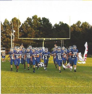
This is It. The varsity Eagles football players bust through the run-through sign on the first game of the season. This game was a heart-wrenching game but a good start to the season.