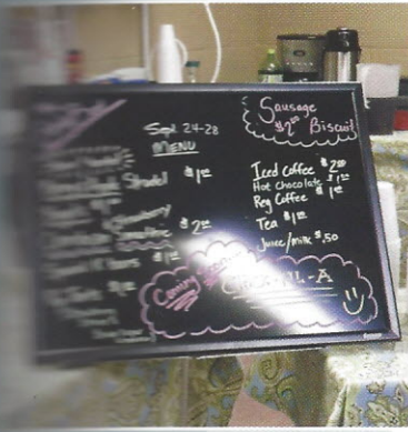
Order Up. The Early Bird Cafe menu displays prices and available items for purchase. Before school, many students loved to start their day off with a visit to the cafe.