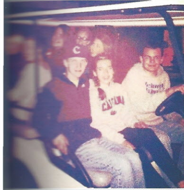
Strip. Many friends pile into a golf cart at the beach and enjoy the ride together. Even though they were cramped uncomfortably, their smiles remained.