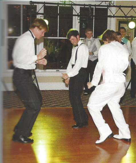
Pretty Fly For a White Guy. These senior boys soak up their spotlight and dance to their requested song.