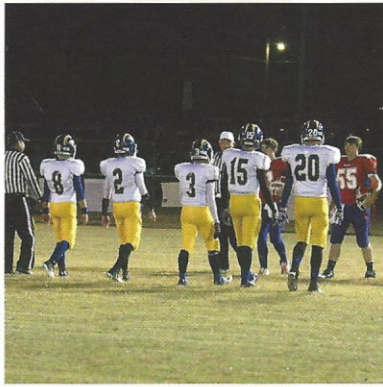
Final Stand. All five senior players were elected team captains before kickoff of their final game as Richard Winn Eagles.