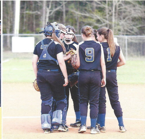
Eagles on 3. Before every inning the Lady Eagles gather inside of the pitcher's circle. This was a ritual for the infielders to unify them and give them time for a mini-pep talk.