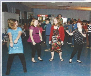
Wobble with It. The fourth grade girls gather together to perform the Wobble at the Valentine's Dance. In addition to dancing, the girls enjoyed posing for pictures with props and costumes in front of the green screen.