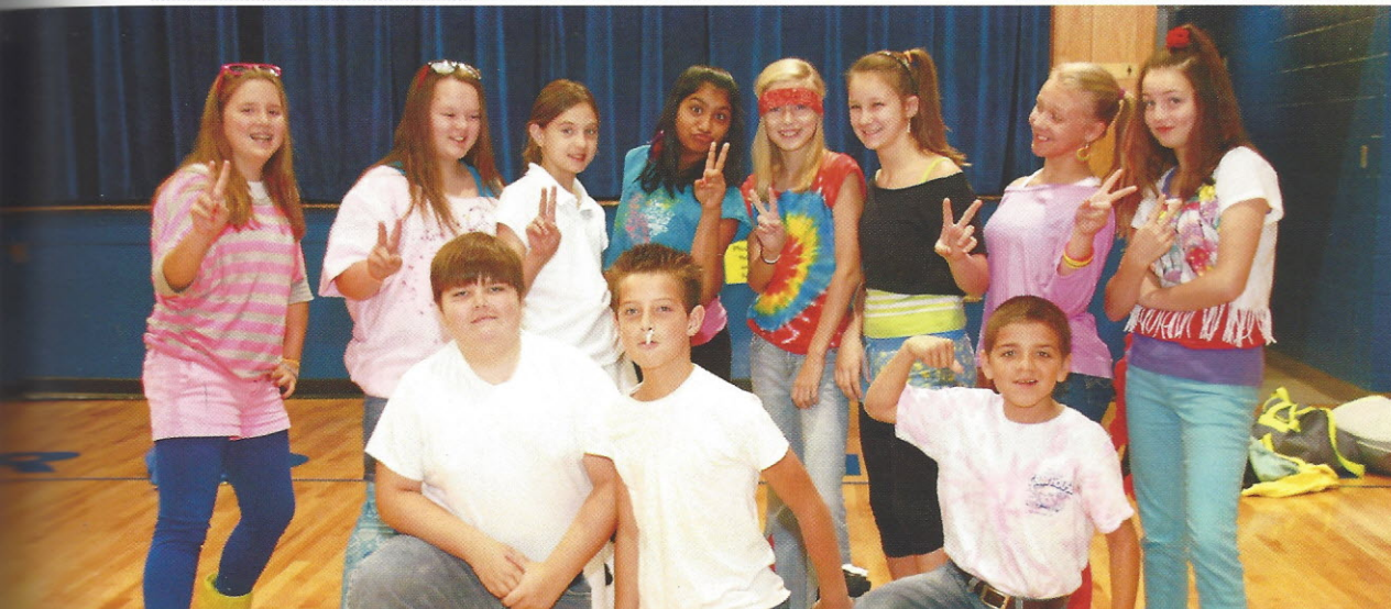
Peace, Love, and Hippyiness. These sixth grade students are more than happy to pose for a quick picture on Decade Day during spirit week. Like most years in the lower school, the sixth grade class dressed up every day and enjoyed spirit week the most compared to any other week during the entire school year.

...hurricanes! " education, discipline, and the love of God! "