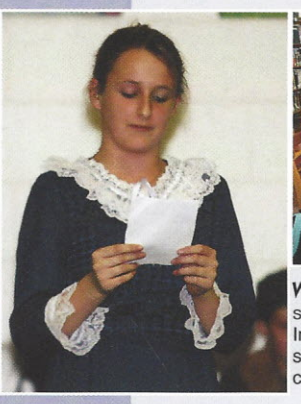
Injury Day, During Spirit seventh grade class expenses creativity.