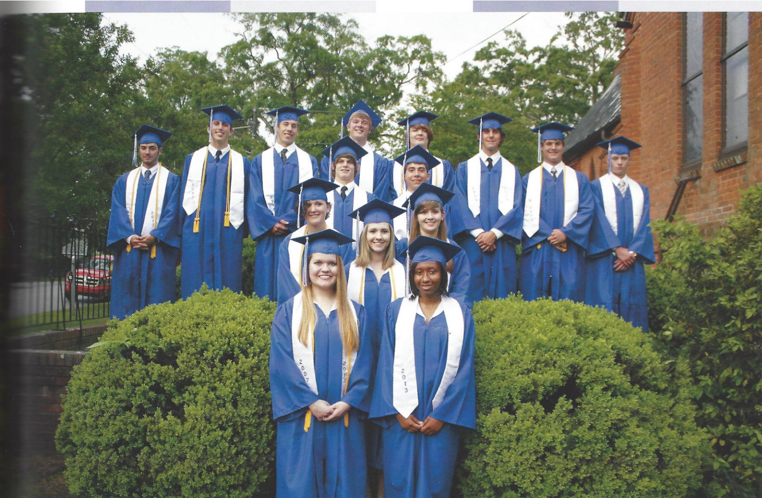
Following the Baccalaureate service, the Junior Marshals and graduating seniors line up and pose for group pictures. Having the service at St. John's Episcopal Church was a break in tradition, the smaller setting provided a more intimate ceremony for the small graduating class.