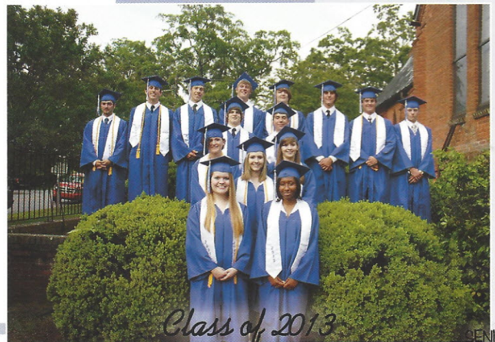
Class of 2013