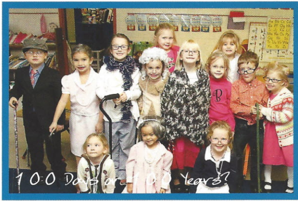
100 Days of School - 100 Years!

"From now until the end of time, no one else will ever see life with my eyes, and I mean to make the best of my chance." - Christopher Morley