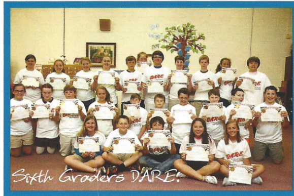
Sixth Graders DARE!