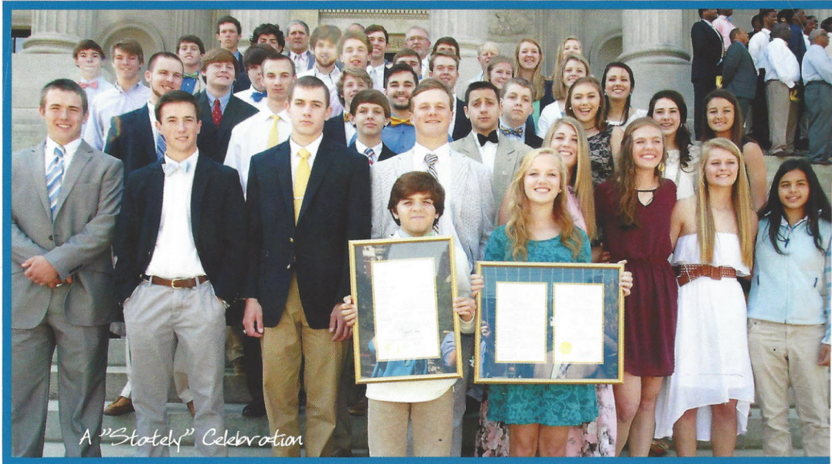
A "Stately" Celebration