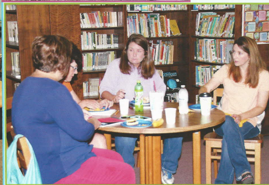
Lunch Break A few of the elementary school teachers enjoy a lunch together during a teachers meeting before the school starts in August.