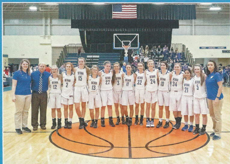
SCISA A State Champions