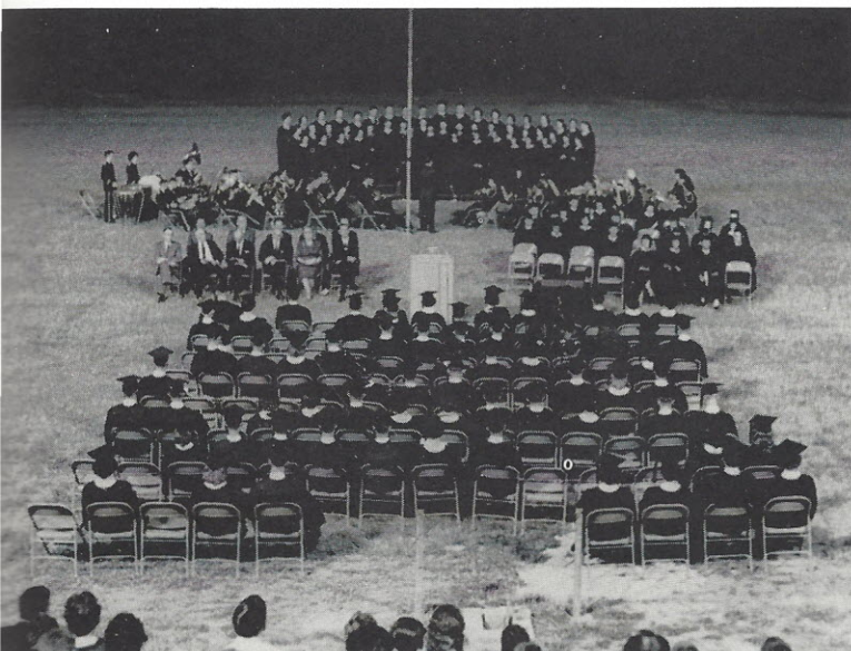
Glee Club sings "Testament of Nations"