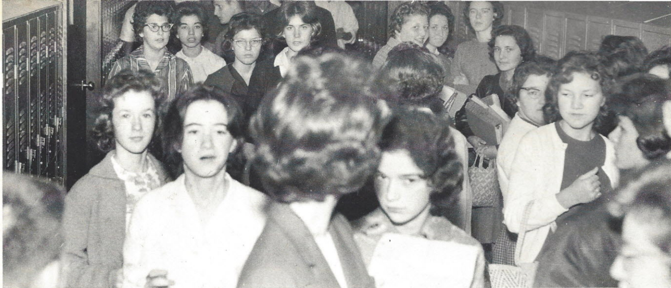
This scene shows the big problem one faces if he wants to go down the eighth grade hall during fifteen-minute break.