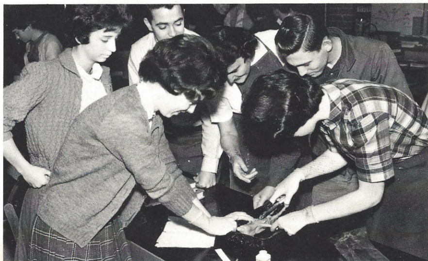
This little piggy didn't go to market but ended up in the biology lab.