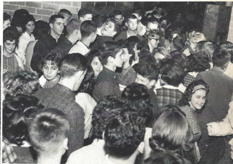
The hall to the left looks quite lonely minutes before the first lunch period, but the picture above shows a slight change after the 12:20 bell.