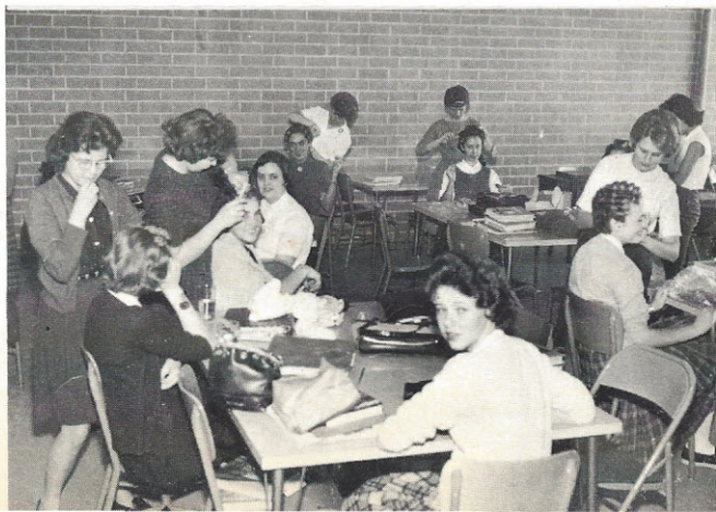
No, this isn't a beauty parlor, but a good action shot of those creative home-ec girls at work.