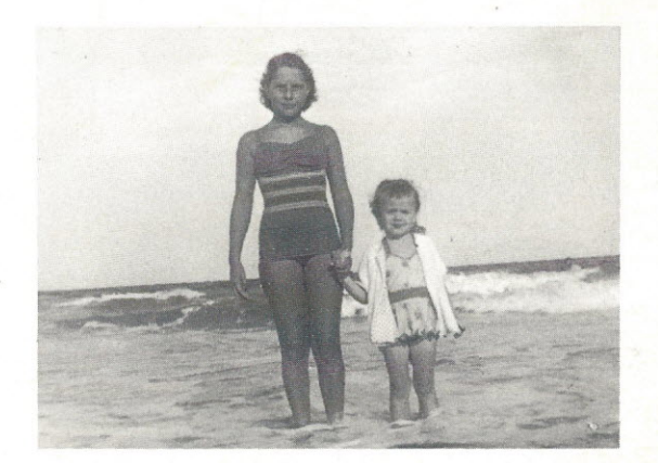
In the good ole summertime!