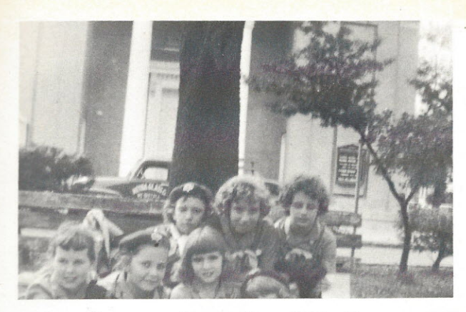
Girls, you'll never get those cookies sold like this.