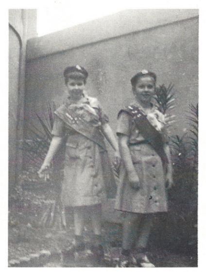
What's the matter, Betty. Did ya fall down?