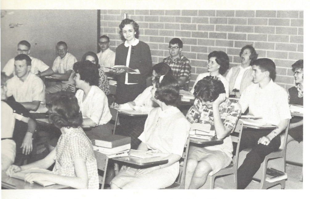
"Comment vous portez-vous aujourd 'hui, Elizabeth?"