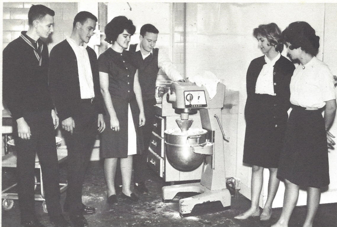
"'Double, double toil and trouble; fire burn, and caldron bubble.'"

SENIORS . . . winning the first football game of the season with OUR varsity players . . . reading Ivanhoe . . . being first in the lunch line . . .