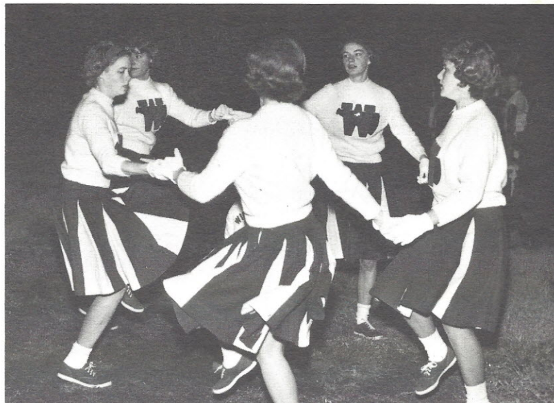
"Ring around the roses . . . last one to stoop tells her boyfriend!"