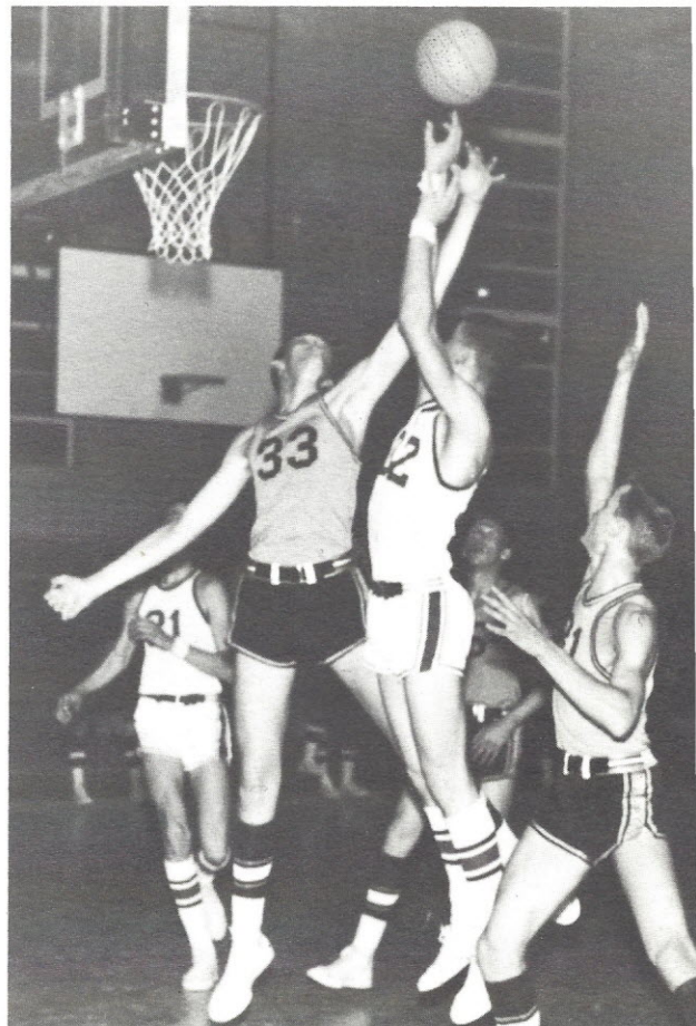
"But this is our goal—you can't score here!"