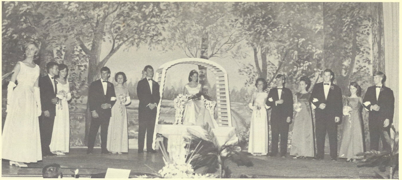
MISS HALCYON and Her Court.