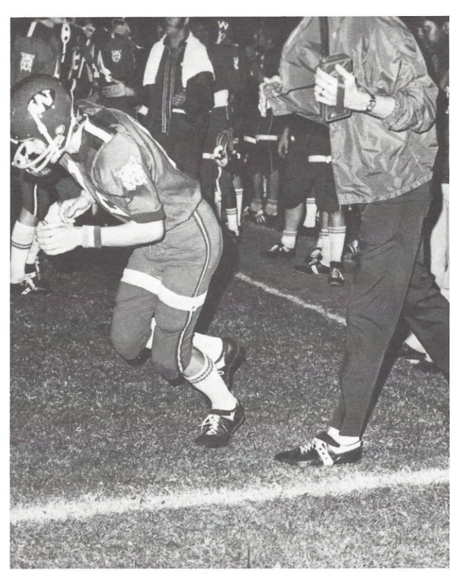
"I think I'm going to fall on my face!"