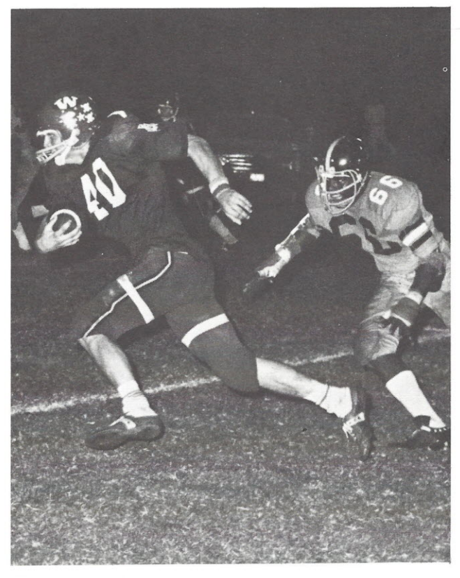
"I'm on my way home!"