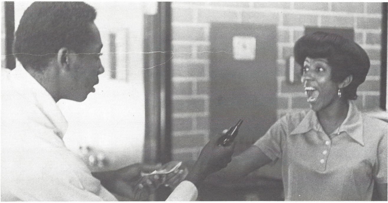
"Uh-oh, there's the bell. I'll be back during my free period."