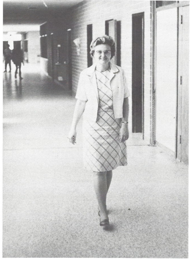
Bum, Bum, here she comes!