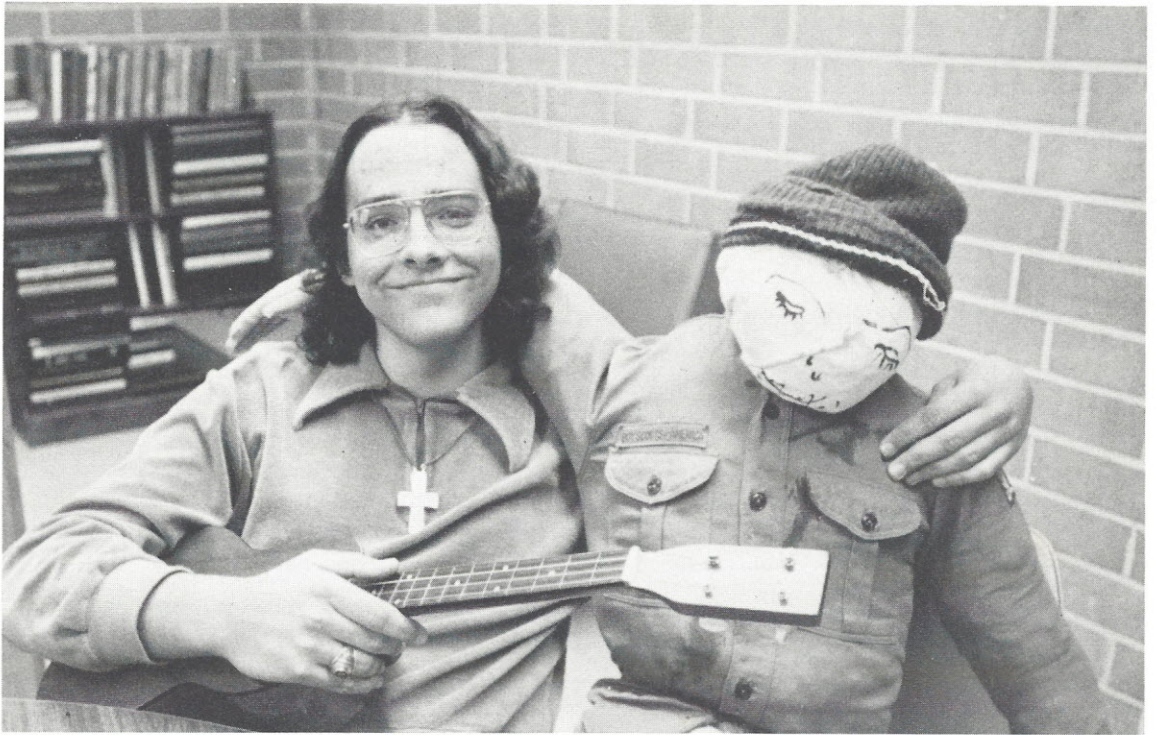
Happiness is being with the thing you love.