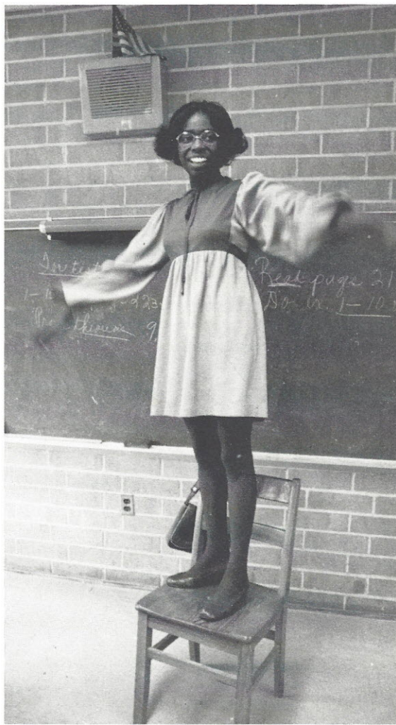
"Gee, I'm a tree!" (Geometry)