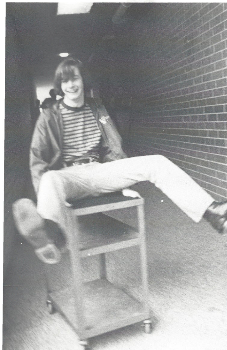
Rollin', Rollin', Rollin' on the book cart.