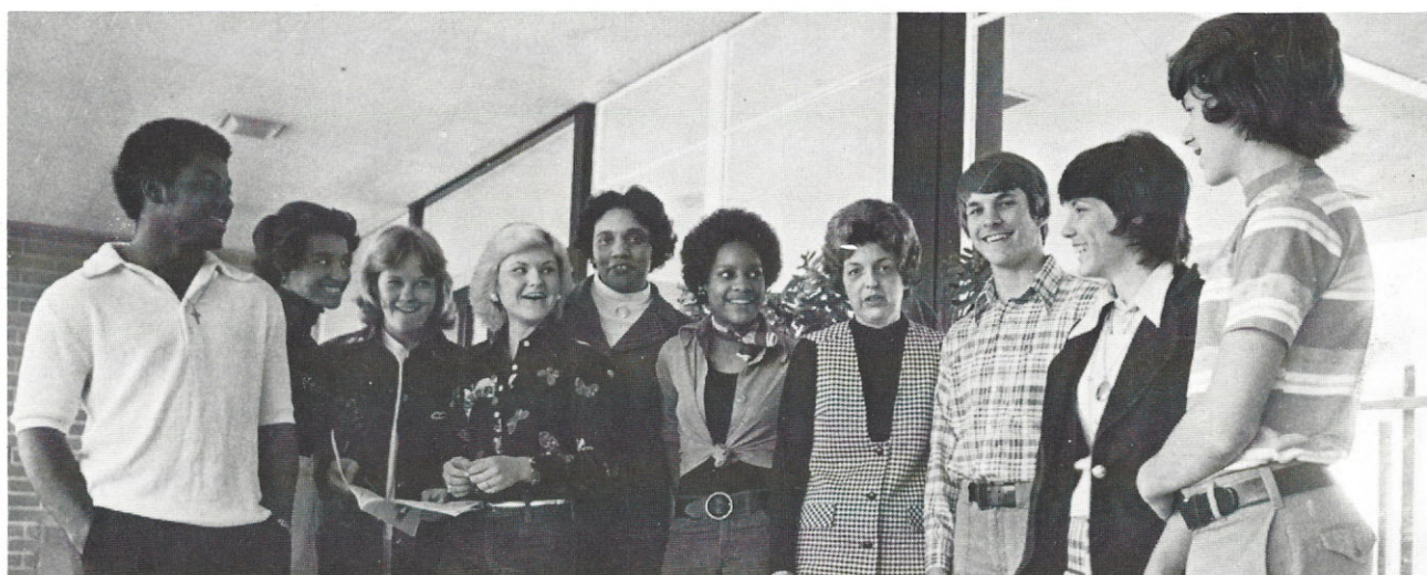
The Student Advisory is a committee that smiles.