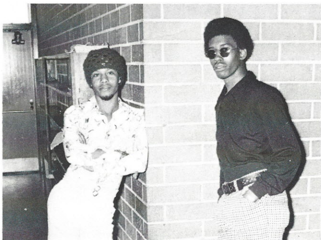
That's one way to keep the walls from tumbling down!