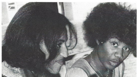
"Sorry man, these two are taken!"