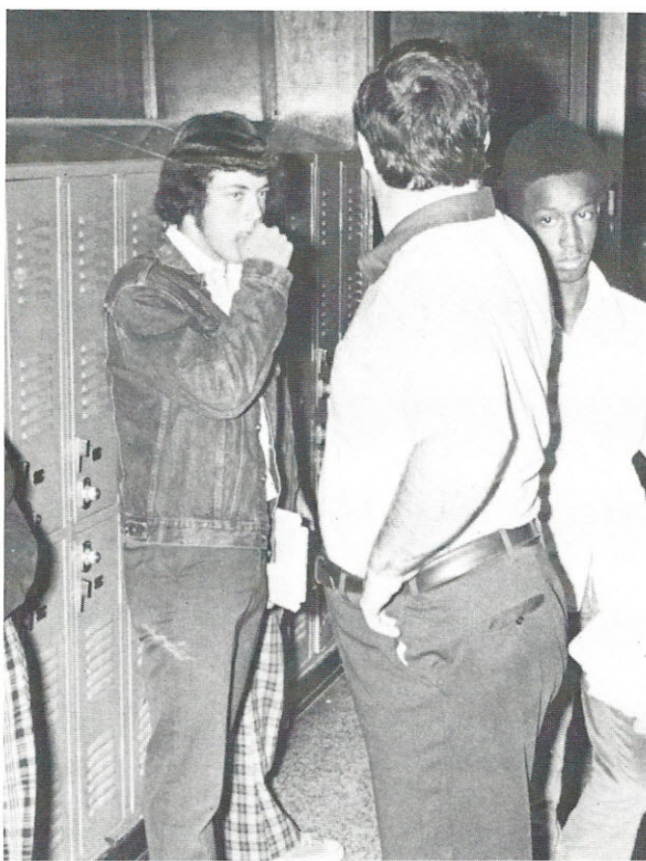
"Ugh! This milk is sour!"