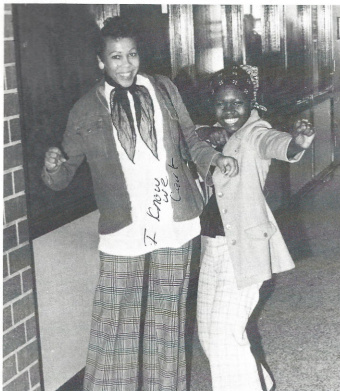
"Can't tell me nothing!"