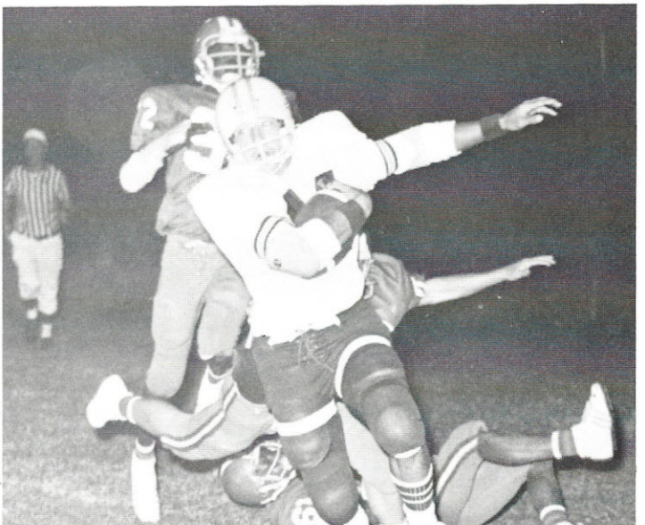
Hurry! Which way is out?