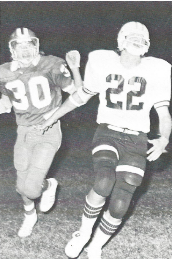
Tiptoe through the tulips!