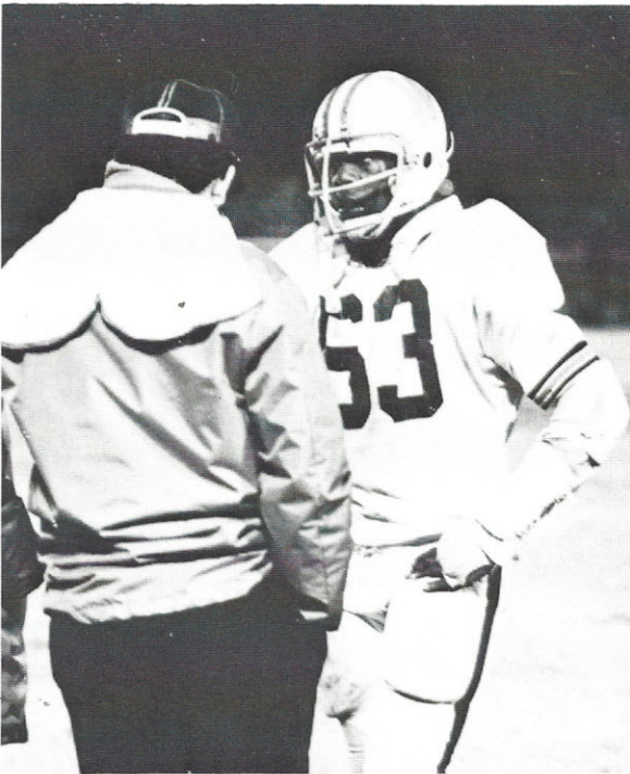
No! Not me!