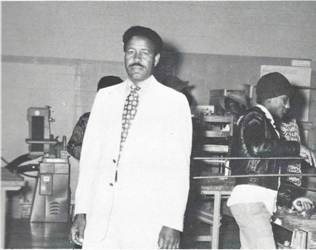
BLD. CONSTRUCTION: Nelson Sims