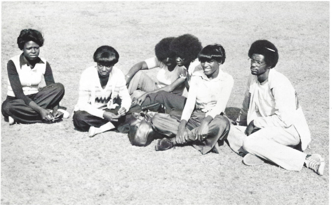
Will the day ever end?