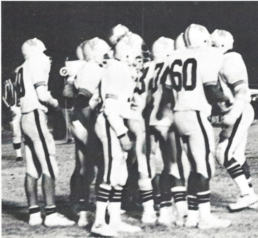
I've got the ball. Now what do we do?