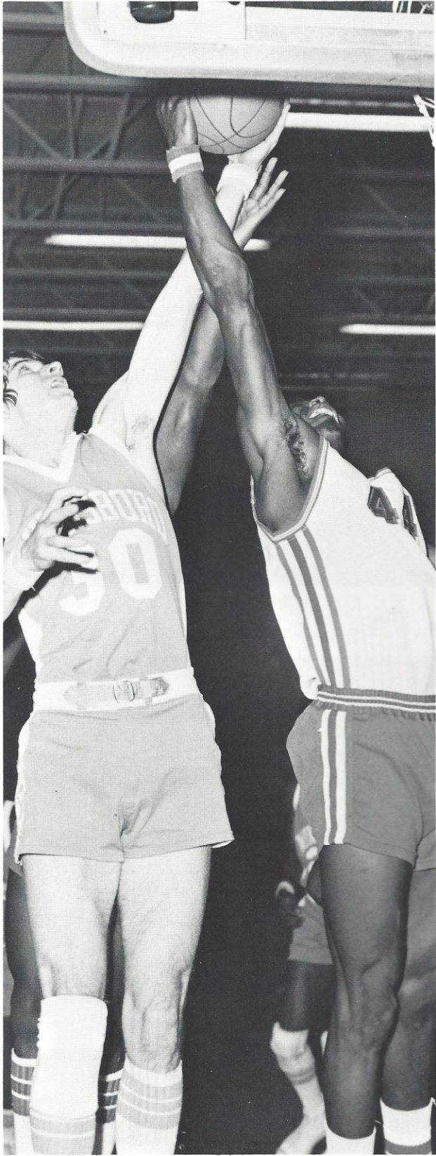
Bobby, where did you get the two extra arms?