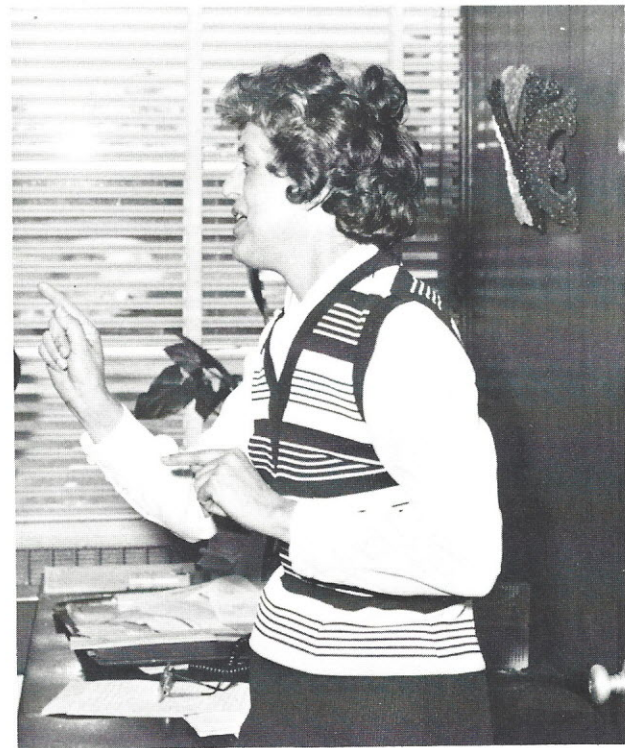
Faucet directs the Fickle Finger of Fate.