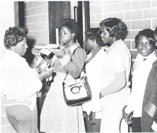
Hmm! Looks good to me.