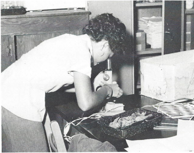
So that's the secret ingredient in Kentucky Fried Chicken.