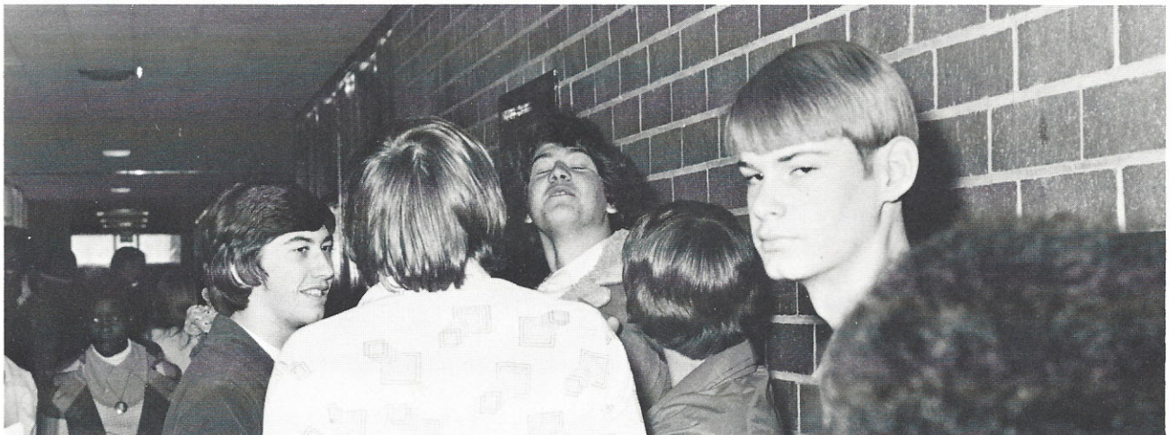
Up your nose with a rubber hose!