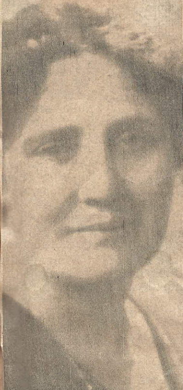
Christian Leader, Educator