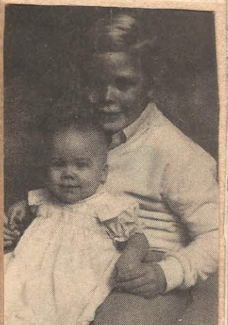
One and Eight