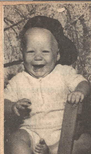
He's one 1982