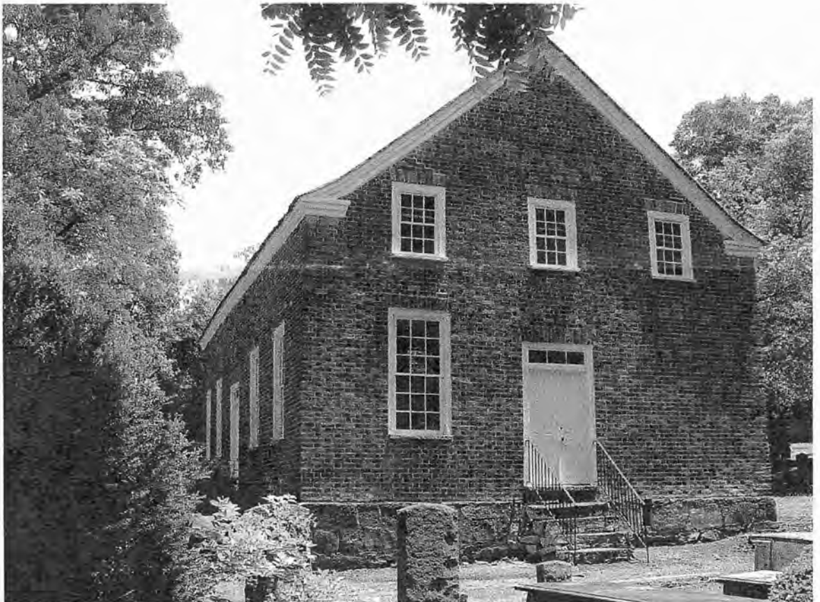
OLD BRICK CHURCH