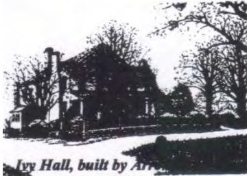
Ivy Hall, built by Arromanus Lyles before 1800