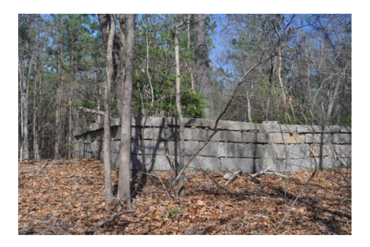
The Copeland-Quigly Cemetery

We would again like to thank the many people who showed us the cemeteries and allowed us to enter their property. Special kudos this month goes to Ben Hornsby, who located and/or got permission from land owners to allow us to document numerous cemeteries in the Bethel Section of the county.